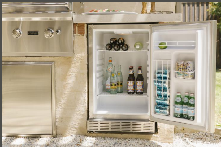
21" Built-in Refrigerator