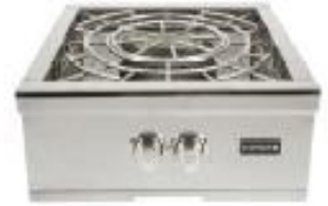
C1PB LP/NG Power Burner