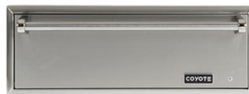
CWD Warming Drawer