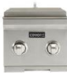
C1DB LP/NG Dual Side Burner