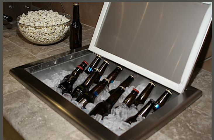
Drop In Cooler