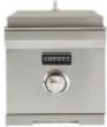
C1SB LP/NG Single Side Burner