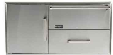
CCD-WD Combo Storage – Warming Drawer