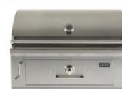
C1CH36 36" Charcoal Grill