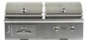
C1HY50 LP/NG 50" Centaur Hybrid Grill