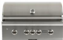
C1SL36 LP/NG 36" S-Series Grill