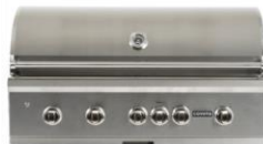
C1SL42 LP/NG 42" S-Series Grill