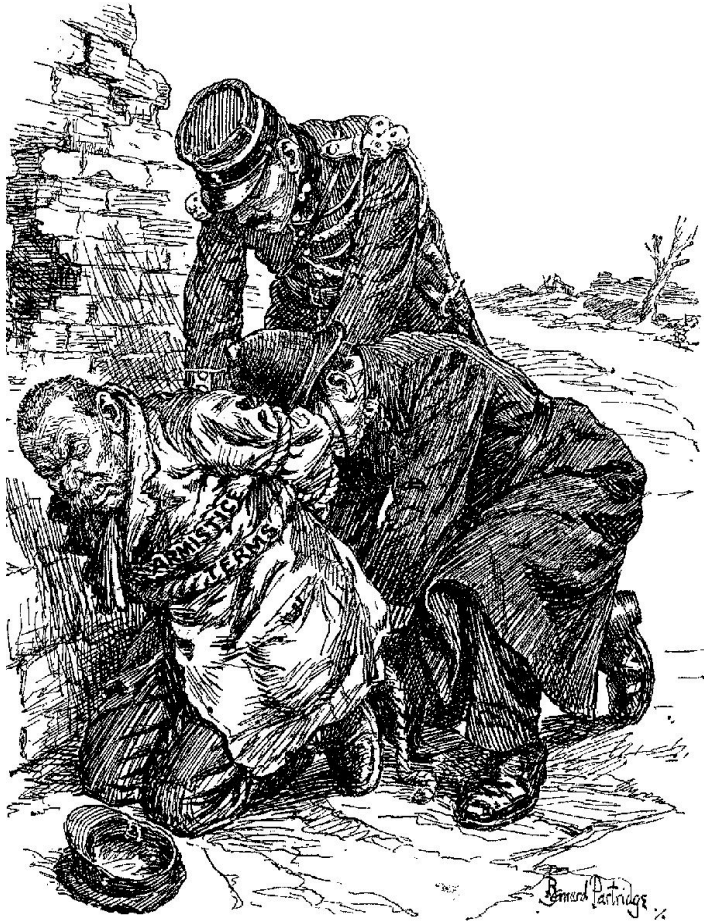
GIVING HIM ROPE?

GERMAN CRIMINAL (to Allied Police). "HERE, I SAY, STOP! YOU'RE HURTING ME! [Aside] I ONLY WINKED ENOUGH I MAY BE ABLE TO WRIGGLE OUT OF THIS YET."