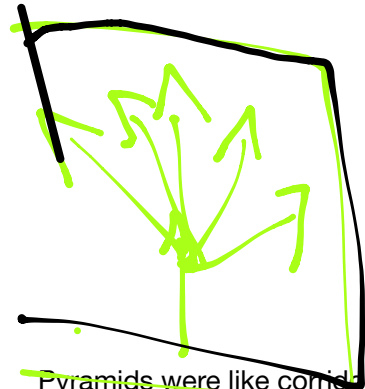
Pyramids were like corridors with many rooms to store the different prayers for the dead pharaoh