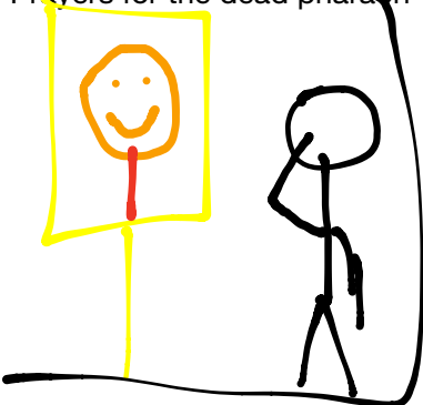
Artists had very strict boundaries on their portrayals of Pharaohs.

→ Crown of Upper / Lower Egypt combined by Narmor • Farmers did pyramid dirty work • Giza built for pyramid workers