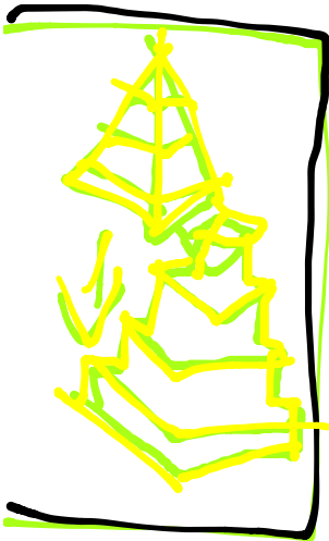
The Egyptians transitioned from regular to step pyramids for Khufu's pyramid